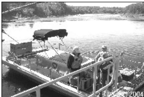
Atlantic Salmon Biologist prepare the barge at the Veazie Power House before checking the fishway trap

the Atlantic ocean where they are prey to other sea creatures, seals, and